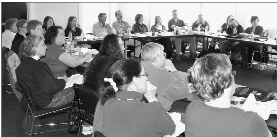
Mental Health and Addictions staff at the Regional Meeting in St. Anthony.