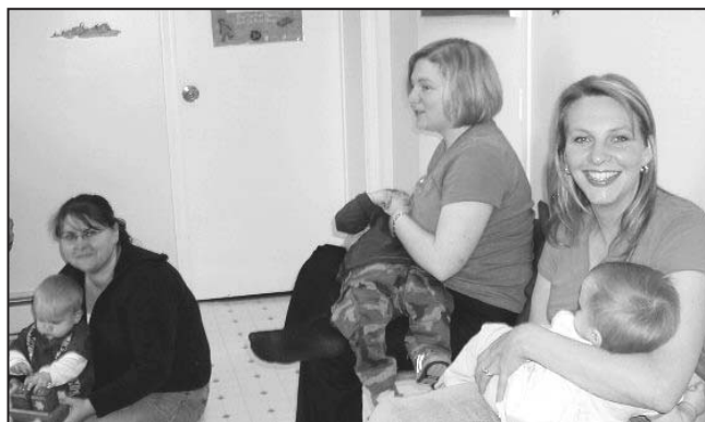
These moms and babies were among seven who took part in the Quintessence Breastfeeding Challenge in St. Anthony.