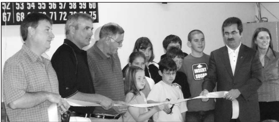
Special guests join children and youth at the launch in the ceremonial ribbon cutting to launch the Community Youth Network.

This past summer we received very exciting news. The Department of Human Resources, Labour and Employment has invested in our community by making funding available to develop a Community Youth Network for our youth.