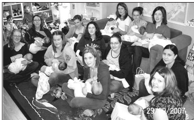
Twelve moms and babies participated in the Labrador West Quintessence Breastfeeding Challenge.