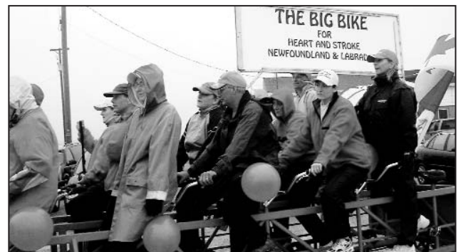
Riders in Flower's Cove donned their wind and rain suits to support this very worthwhile cause.