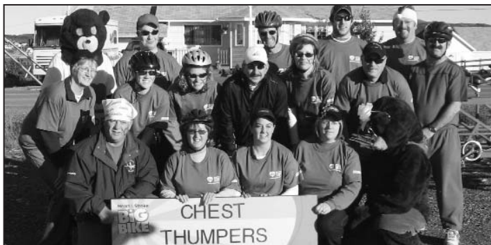
The Chest Thumpers pose before the Big Bike Ride in St. Anthony.

On September 6 and 7, 2007, Labrador-Grenfell Health employees in St. Anthony and Flower's Cove joined their fellow community members in riding the "Big Bike for Heart and Stroke". In St. Anthony, the Chest Thumpers raised over $1200 for this worthy cause. Despite the very rainy weather, two rides were held in Flower's Cove, with the Community Riders and Cardiac Cyclists raising a total of $7890. Special thanks are extended to the organizers, participants and supporters of these events.