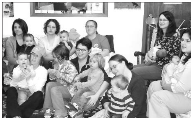
Ten moms and babies gathered in Happy Valley-Goose Bay for the Quintessence Breastfeeding Challenge.

Community Support. Breastfeeding mothers and babies benefit from communities that recognize the importance of supporting the relationship of the mother and baby. The community as a whole needs to be educated about the benefits of breastfeeding as well as the risks associated with NOT breastfeeding. Communities can also support breastfeeding moms and babies by providing them with a comfortable space to breast feed as well as privacy to those moms who want it (NOT PUBLIC WASHROOMS). In addition, workplaces and schools can also provide support through the provision of comfortable feeding areas as well as time for breastfeeding employees and students to nurse their babies. Restaurants as well as other public areas should welcome mothers to breastfeed within their establishments. Many of these areas can be identified as “Breastfeeding Friendly” by displaying their breastfeeding friendly decals on the door of their establishment.